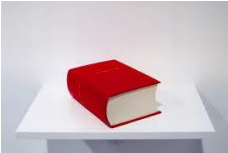
Dora García Libro compuesto por textos de la autora y pastas en piel 2003