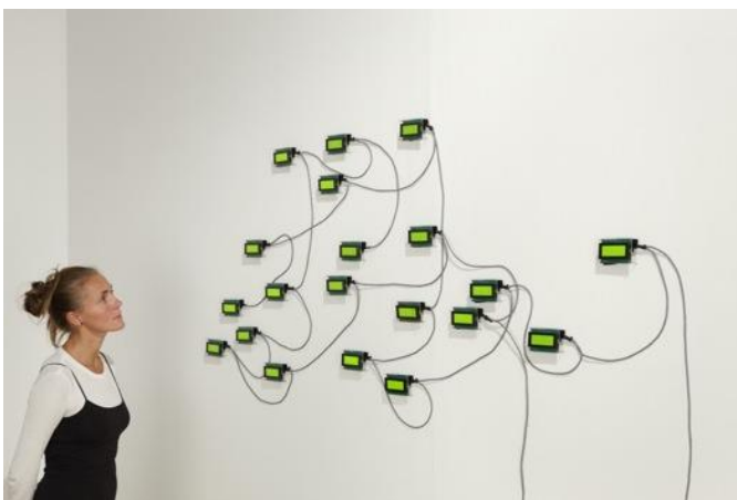
Rafael Lozano-Hemmer, "33 Questions per Minute," 2000.