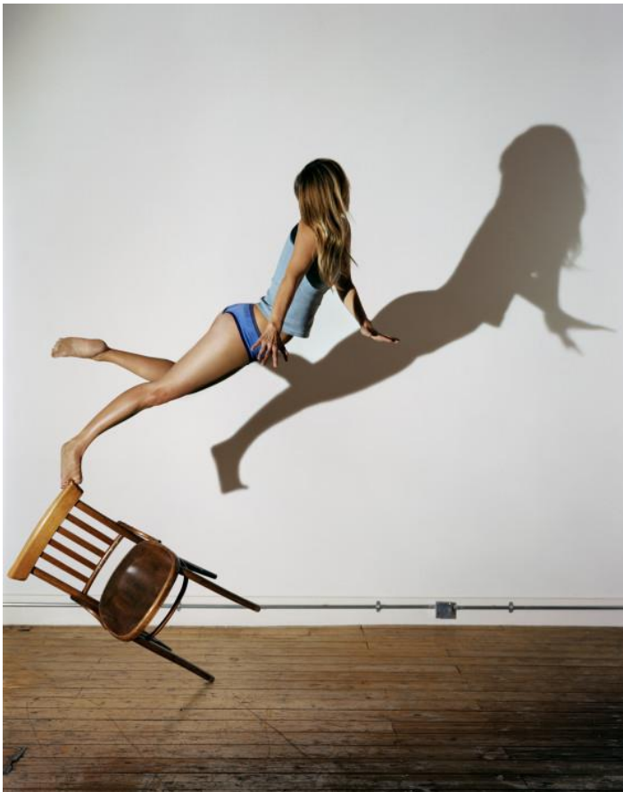
Sam Taylor-Johnson. Bram Stoker's Chair XII, 2005