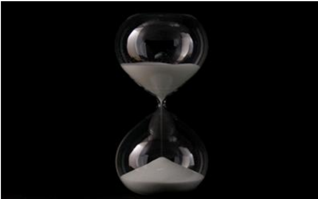
Ignasi Aballí Tiempo como inactividad, 2014 Video projection. 60 min. loop