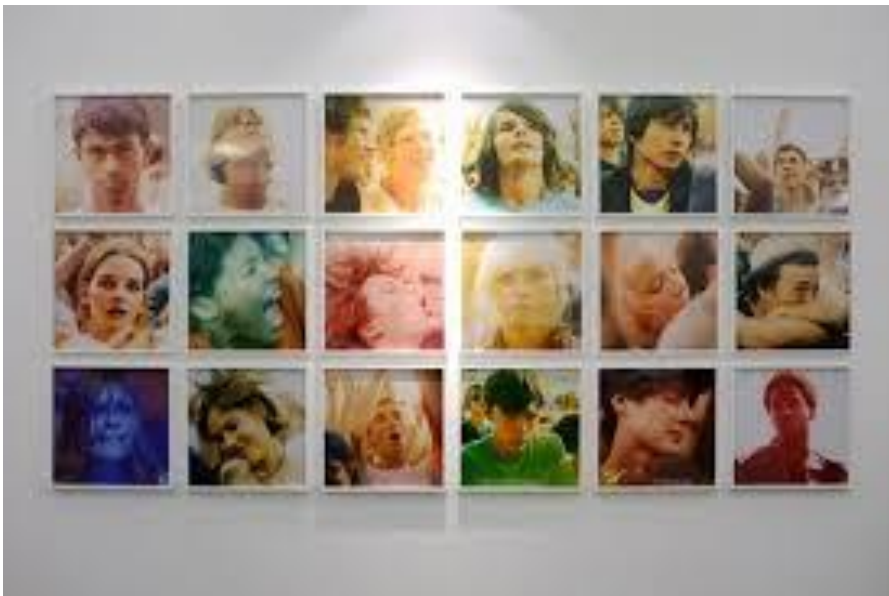
"You and My Friends 5" 2012