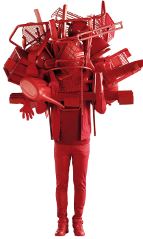
Daniel FIRMAN "Simply red", 2009 Plâtre, vêtements, objets / Plaster, clothes and object 230 x 140 x 120 cm / 90 1/2 x 55 1/8 x 47 1/4 inches