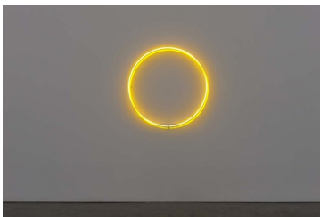
LAURENT GRASSO "Eclipse" 2013 Neon / Néon 39 1/4 inches Ø / 100 cm Ø Edition of 5