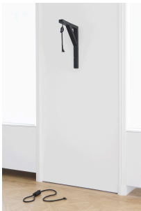
ELMGREEN & DRAGSET "Second chance", 2013 Bronze patiné et ciré / Black patinated and waxed bronze cast 70 x 100 x 7 cm / 27 1/2 x 39 1/4 x 2 3/4 inches Courtesy of the artists and Galerie Perrotin